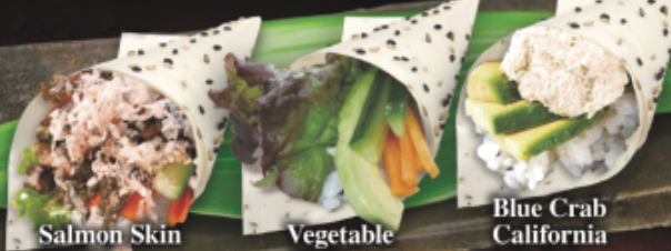
Salmon Skin Vegetable Blue Crab California