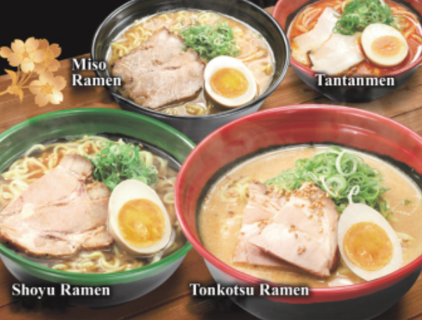
Miso Ramen Tantanmen Shoyu Ramen Tonkotsu Ramen