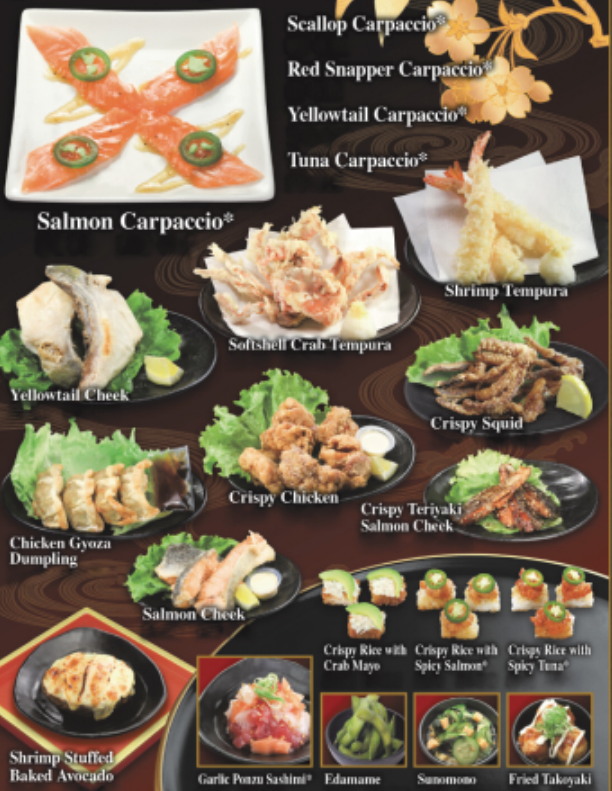
Salmon Carpaccio* Scallop Carpaccio* Red Snapper Carpaccio* Yellowtail Carpaccio* Tuna Carpaccio* Shrimp Tempura Softshell Crab Tempura Yellowtail Check Chicken Gyoza Dumpling Salmon Check Crispy Chicken Crispy Teriyaki Salmon Check Crispy Squid Crispy Rice with Crab Mayo Crispy Rice with Spicy Salmon* Crispy Rice with Spicy Tuna* Shrimp Stuffed Baked Avocado Garlic Ponzu Sashimi* Edamame Sanmonono Fried Takoyaki