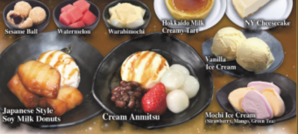
Sesame Ball Watermelon Warabimochi Hokkaido Milk Creamy-Tart NY Cheesecake Japanese Style Soy Milk Donuts Cream Anmitsu Mochi Ice Cream (Strawberry, Mango, Green Tea) Vanilla Ice Cream