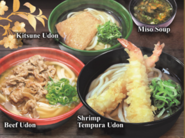
Kitsune Udon Miso Soup Beef Udon Shrimp Tempura Udon