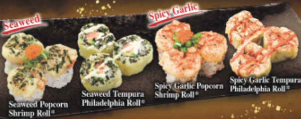
Seaweed Popcorn Shrimp Roll* Seaweed Tempura Philadelphia Roll* Spicy Garlic Popcorn Shrimp Roll* Spicy Garlic Tempura Philadelphia Roll*