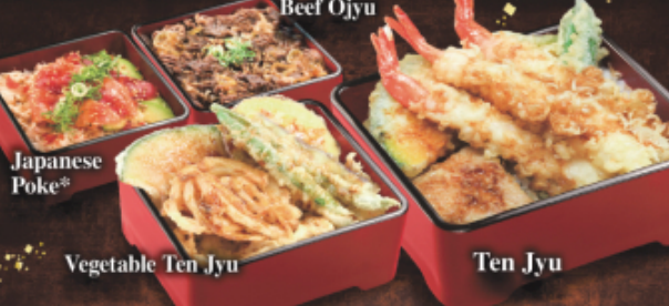
Japanese Poke* Beef Ojyu Vegetable Ten Jyu Ten Jyu